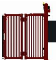
Aluminium – Single Wing