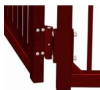
Machined hinge, with-stands a load of 400 kg