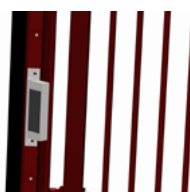
Electro magnetic lock.