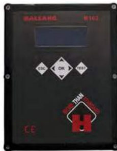
Electrical cabinet equipped with a Halsang H102 controller and frequency modulators