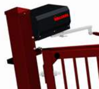
Worm geared motor with hollow sleeve.